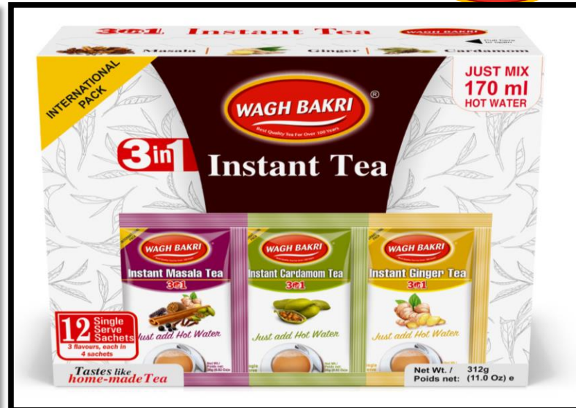
COMBO PACK – INSTANT TEA PREMIX 312g