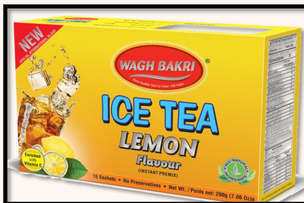
LEMON ICE TEA