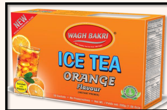
ORANGE ICE TEA