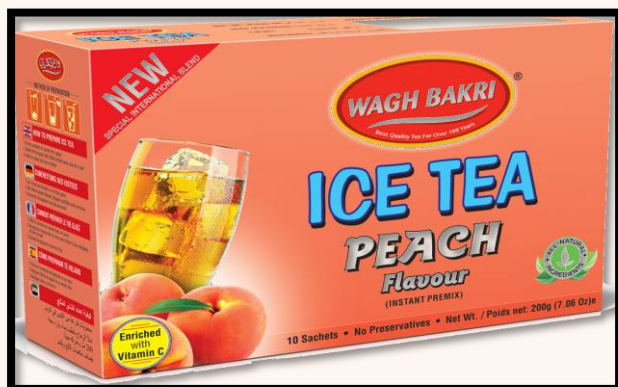
PEACH ICE TEA