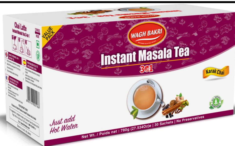
MASALA INSTANT TEA 3 IN 1 VALUE PACK